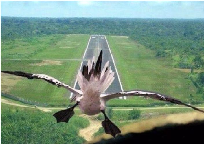
Final approach - You don't want to be No2 in the pattern